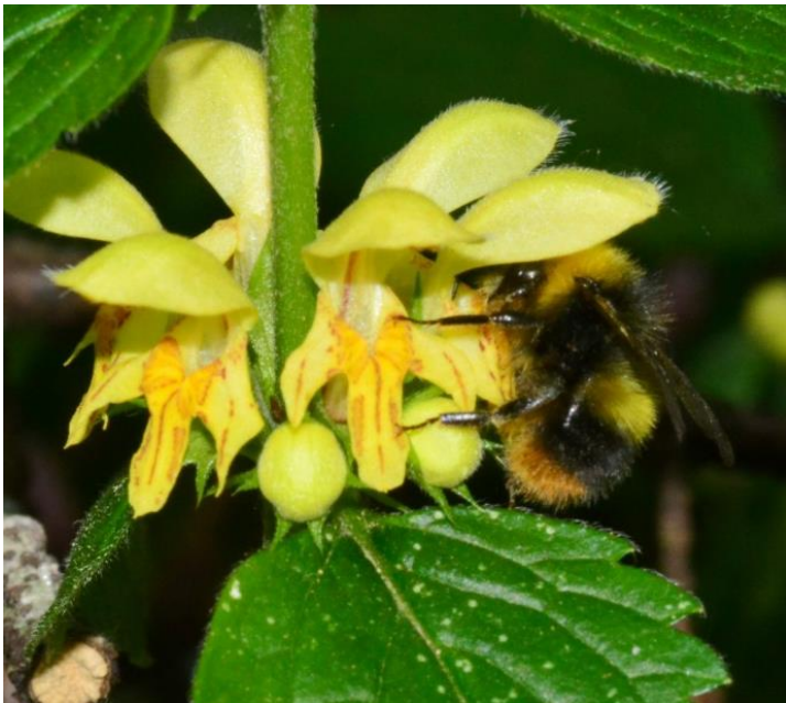
Pic.3. Bombus pratorum worker on Yellow archangel (Fekete, 2018)

This early spring species is an excellent bumblebee-mimic (see images below), which frequently visits willow, blackthorn and wild cherry. Criorhina ranunculi is mainly a southern species where they breed in rotting (mainly oak or birch) tree trunks. This insect tends to stay up high in a canopy, therefore not often can be seen. As it is evident from the photos, hoverflies also excellent and very important pollinator species alongside bees.