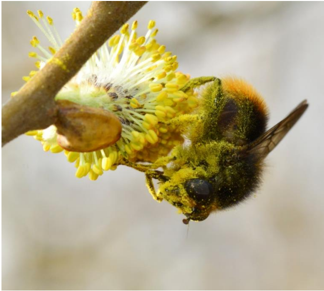
Pic.1. Criorhina ranunculi hoverfly covered in pollen (Fekete, 2019)