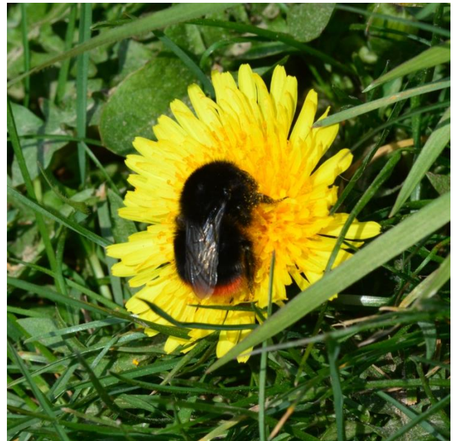
Pic.4. Queen Bombus lapidarius on Dandelion (Fekete, 2019)

Early bumblebee ( B. pratorum ) is one of the earliest bumblebees to emerge in the spring. This species is widespread and common throughout Britain, due to its wide range of diet of pollen and nectar. Red-tailed bumblebee ( B. lapidarius ) is also a common species which can be found in many habitats, e.g. woodlands, gardens, flower-rich grasslands.