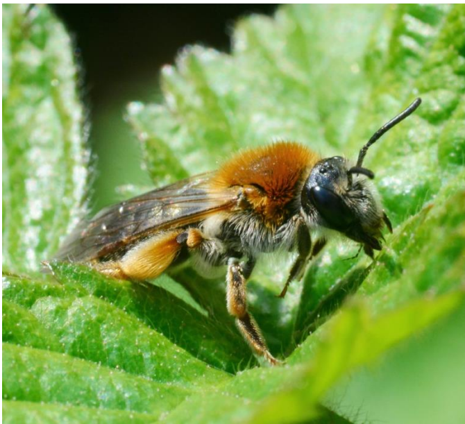
Pic.23. Female Andrena haemorrhoa (Fekete, 2018)

Short-fringed Mining bee ( Andrena dorsata ) is also a southern species which has two generations; one in the spring and one in the summer. The Buff-tailed Mining bee ( Andrena nigroaenea ) is one of our commonest mining bees that likes to forage on gorse, willows, blackthorn and hawthorn.