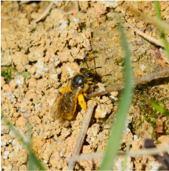
Pic.9. Pollen-laden female Lasioglossum spp. (Fekete, 2019)