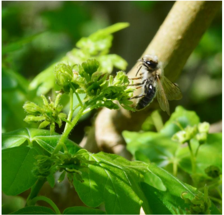
Pic.18. Male Andrena species on Field maple (Fekete, 2019)

One of the 12 known British Mason bees, ( Osmia caerulescens ) is a striking bee with metallic green or blue colouring mainly seen on the abdomen of males. Female bees of this species typically chew up plant material to create mastic and seal their nest cells. This bee is rarely common anywhere and usually nests in hollow stems of plants, e.g. brambles.