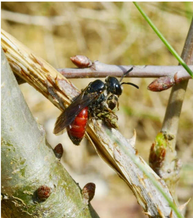
Pic. 15. Poss. Female Sphecodes gibbus (Fekete, 2019)

Another fascinating and beautiful insect group is the Nomada . These relatively hairless bees are cleptoparasites of mining bees (mainly Andrena species). This means that the female sneaks into the mining bee's nest, lay an egg onto the wall of an unsealed nest cell. Later on the Nomada larva proceeds to destroy the host egg and continue to feed on the food store until it hatches. There are 34 different species can be found in Britain.