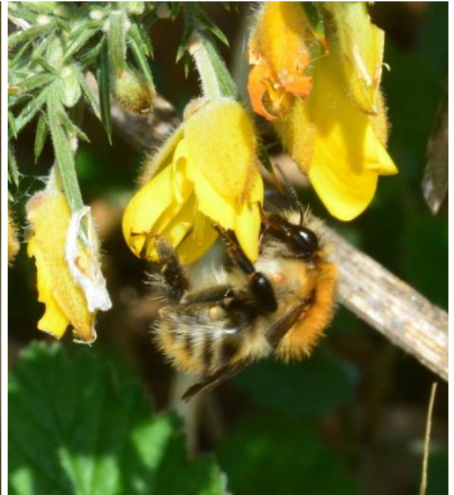
Pic.6. Bombus pascuorum worker on gorse (Fekete, 2018)

There are 27 bumblebee species currently on the British list with several species showing considerable declines and range contractions. The Tree bumblebee ( B. hypnorum ) is a recent colonist of the British Isles having been first recorded in Wiltshire in 2001. True to its name, this bumblebee has an aerial nesting preference, often occupying bird nests, cavities. Predominantly a woodland species, but can be found in gardens too especially where brambles and cotoneaster are in abundance. Common carder bee ( B. pascuorum ) can utilise many habitats, nests can be found in dense tussocky grass and under hedges.