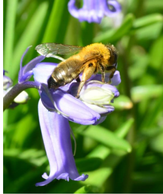
Pic.22. Female Andrena nigroaenea (Fekete, 2018)

Short-fringed Mining bee ( Andrena dorsata ) is also a southern species which has two generations; one in the spring and one in the summer. The Buff-tailed Mining bee ( Andrena nigroaenea ) is one of our commonest mining bees that likes to forage on gorse, willows, blackthorn and hawthorn.