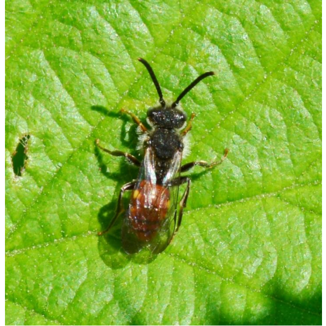
Pic.14. Male Nomada flavoguttata (Fekete, 2019)

Another fascinating and beautiful insect group is the Nomada . These relatively hairless bees are cleptoparasites of mining bees (mainly Andrena species). This means that the female sneaks into the mining bee's nest, lay an egg onto the wall of an unsealed nest cell. Later on the Nomada larva proceeds to destroy the host egg and continue to feed on the food store until it hatches. There are 34 different species can be found in Britain.