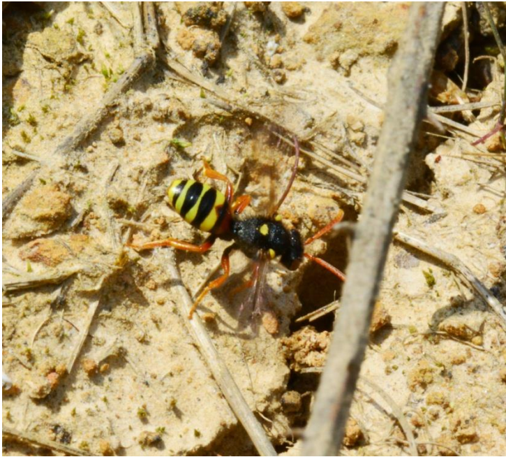
Pic.13. Nomada fucata at mining bee nest entrance (Fekete, 2019)