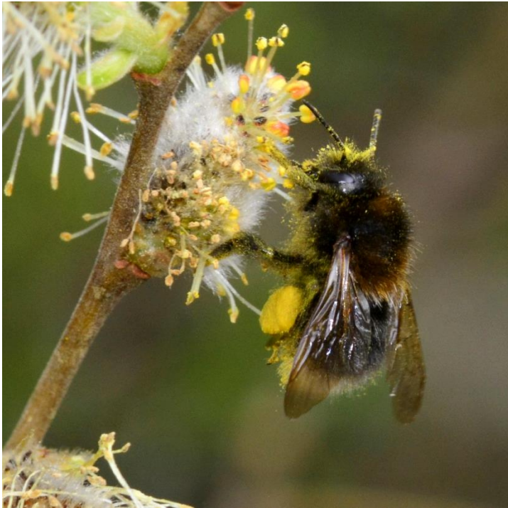
Pic.5. Bombus hypnorum worker on Sallow (Fekete, 2019)