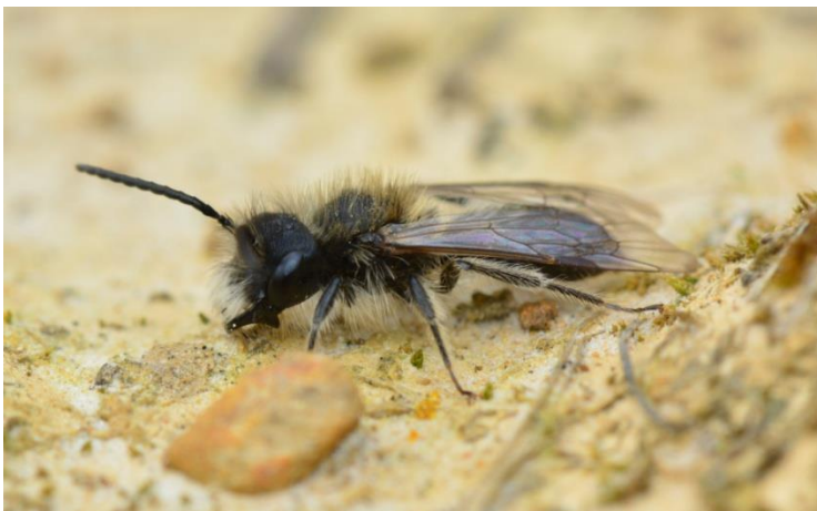
Pic.7. Male Andrena apicata (Fekete, 2019)

There are 27 bumblebee species currently on the British list with several species showing considerable declines and range contractions. The Tree bumblebee ( B. hypnorum ) is a recent colonist of the British Isles having been first recorded in Wiltshire in 2001. True to its name, this bumblebee has an aerial nesting preference, often occupying bird nests, cavities. Predominantly a woodland species, but can be found in gardens too especially where brambles and cotoneaster are in abundance. Common carder bee ( B. pascuorum ) can utilise many habitats, nests can be found in dense tussocky grass and under hedges.