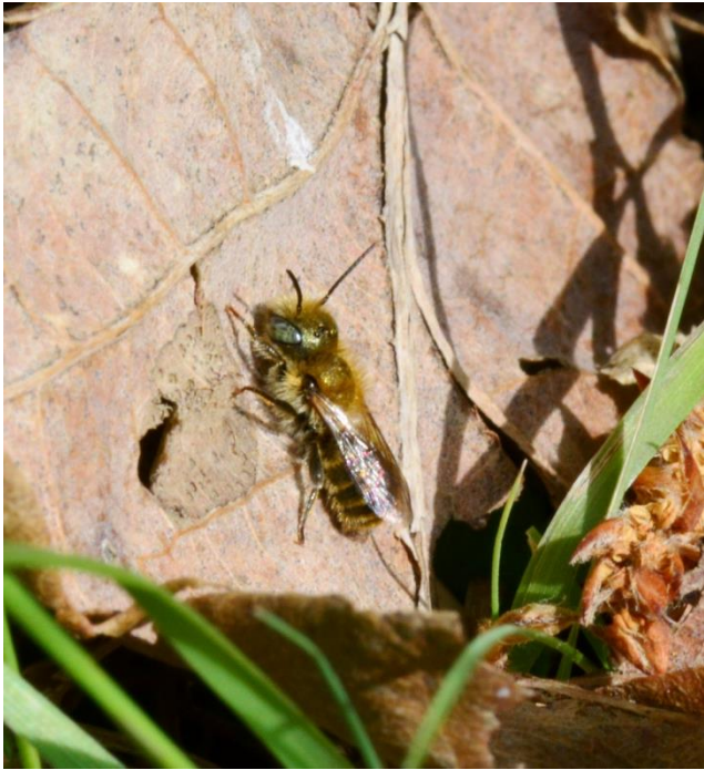
Pic.17. Male Osmia caerulescens (Fekete, 2019)