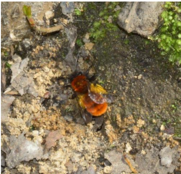
Pic.19. Female Andrena fulva (Fekete, 2018)

One of the 12 known British Mason bees, ( Osmia caerulescens ) is a striking bee with metallic green or blue colouring mainly seen on the abdomen of males. Female bees of this species typically chew up plant material to create mastic and seal their nest cells. This bee is rarely common anywhere and usually nests in hollow stems of plants, e.g. brambles.