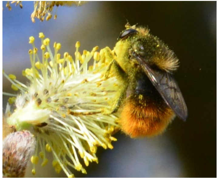
Pic.2. Criorhina ranunculi on Sallow (Fekete, 2019)

This early spring species is an excellent bumblebee-mimic (see images below), which frequently visits willow, blackthorn and wild cherry. Criorhina ranunculi is mainly a southern species where they breed in rotting (mainly oak or birch) tree trunks. This insect tends to stay up high in a canopy, therefore not often can be seen. As it is evident from the photos, hoverflies also excellent and very important pollinator species alongside bees.