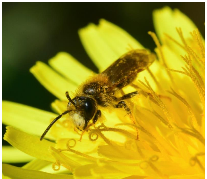
Pic. 24. Male Andrena chrysoceles (Fekete, 2018)

The female Orange-tailed Mining bee ( Andrena haemorrhoa ) is also characteristic and easily recognisable with the bright orange hairs at the tip of its abdomen. It is also a common species which likes to forage on gorse, maple and willows. The Hawthorn Mining bee ( Andrena chrysoceles ) is a solitary mining bee found mainly in Southern Britain. Males can be recognised by their pale yellow faces with two black spots. This bee is more tolerant of clay soils than other bees (Falk,2015).