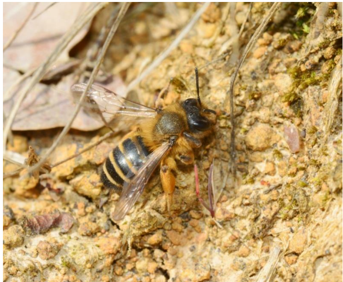
Pic. 20. Female Andrena flavipes (Fekete, 2018)

The female of Tawny Mining bee ( Andrena fulva ) is one of the most recognisable mining bees with its dense orange-furred abdomen and thorax. This bee has a habit of nesting in large aggregations along footpaths, hillsides, field margins, just as Yello-legged Mining bee ( Andrena flavipes ).