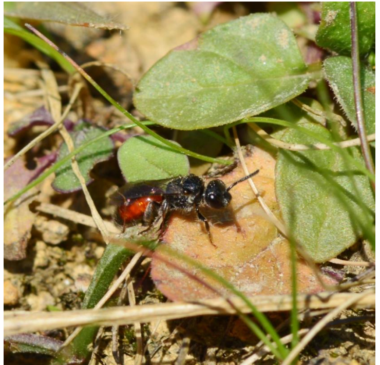
Pic.16. Poss. Female Sphecodes monilicornis

Another cleptoparasitic group is the Sphecodes with 17 different species in Britain. These bees are usually have black and red abdomen and fairly hairless. They differ from Nomada in their tactic - they enter the host nest, open up a cell and destroy the egg while replacing it with their own egg, finally resealing it. Finding cleptoparasitic bees are generally a good sign, meaning that it is a healthy population of true, working solitary bees that can sustain parasitism and can still thrive regardless.