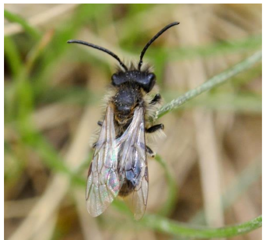
Pic.8. Male Andrena apicata (Fekete, 2019)

The largest group of mining bees, Andrena is represented by 67 species in Britain. The Large Sallow Mining bee ( Andrena apicata ) is a nationally scarce (Nb) solitary mining bee and it is strongly associated with its food plant, the willow (mainly Goat or Grey willow). The species is never numerous, therefore, I was very delighted to have found this species around the Pond Meadow. Nesting occurs in lighter soil in loose aggregations.