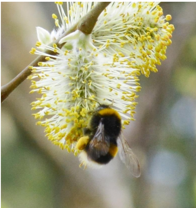
Pic.11. Worker Bombus lucorum/terrestris/cryptarum (Fekete, 2019)

These tiny, solitary mining bees can be easily overlooked in the field. Lasioglossum is the world's largest bee genus (1,700 species worldwide) with 34 different species described in Britain and identification of individual species sometimes can be challenging.