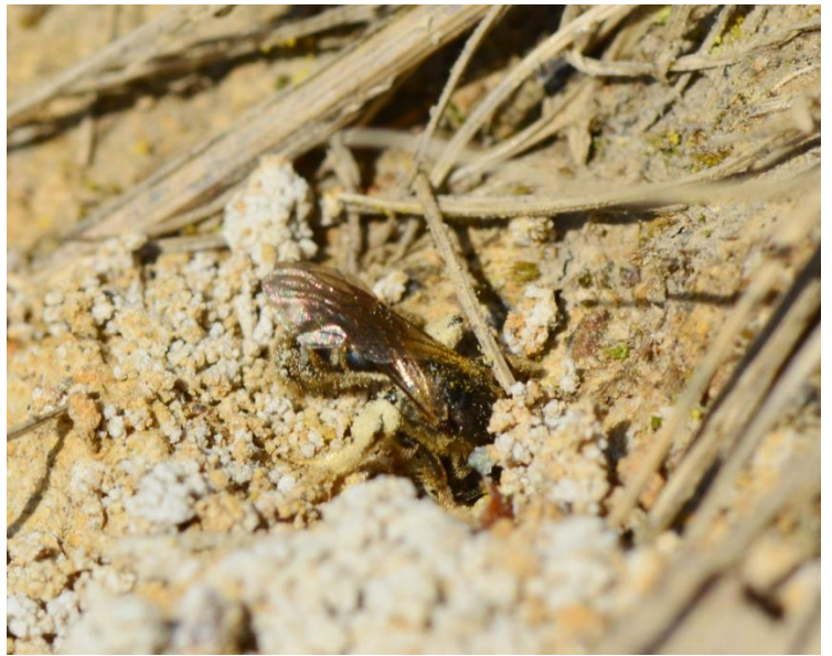
Pic.10. Female Lasioglossum is excavating nest (Fekete, 2019)

These tiny, solitary mining bees can be easily overlooked in the field. Lasioglossum is the world's largest bee genus (1,700 species worldwide) with 34 different species described in Britain and identification of individual species sometimes can be challenging.